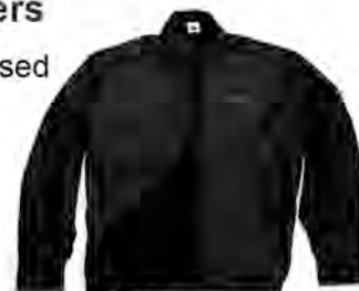
Please allow 6 to 8 weeks for delivery.

Please complete the enclosed application form, return it and we will send you your FREE jacket.